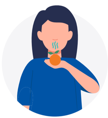
DECREASE SENSE OF SMELL

Do not enter hospital if you have two (2) of the following: