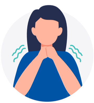
SHAKES OR CHILLS